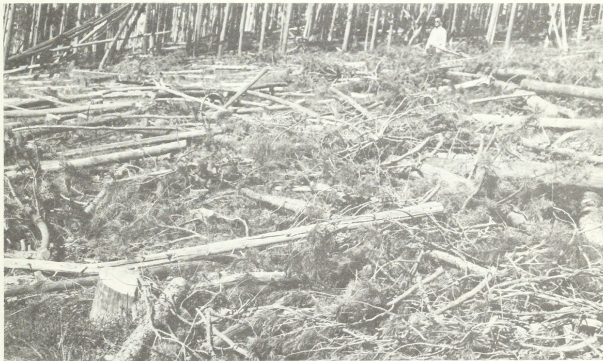
Figure 1.--Typical logging slash in mature lodgepole pine. The sound dead material could provide up to 100 pieces per acre of houselogs, rails, and fenceposts.

During the past 3 years, the Bitterroot Resource Conservation and Development Committee (RC&D), the Intermountain Forest and Range Experiment Station, the Forest Service, and the Bitterroot National Forest have worked together to identify and evaluate alternatives for expanding forest-based industry in the Bitterroot Valley. The level of unemployment and underemployment is high among Bitterroot Valley workers who depend, at least in part, upon woods work for a living. At the same time, substantial volumes of available wood are not being utilized: extensive dead timber, smaller stems in stagnated stands, and material left on the site as residue following conventional logging operations (fig. 1). These conditions typify mature lodgepole pine stands, which until recently have been only lightly utilized for timber products.